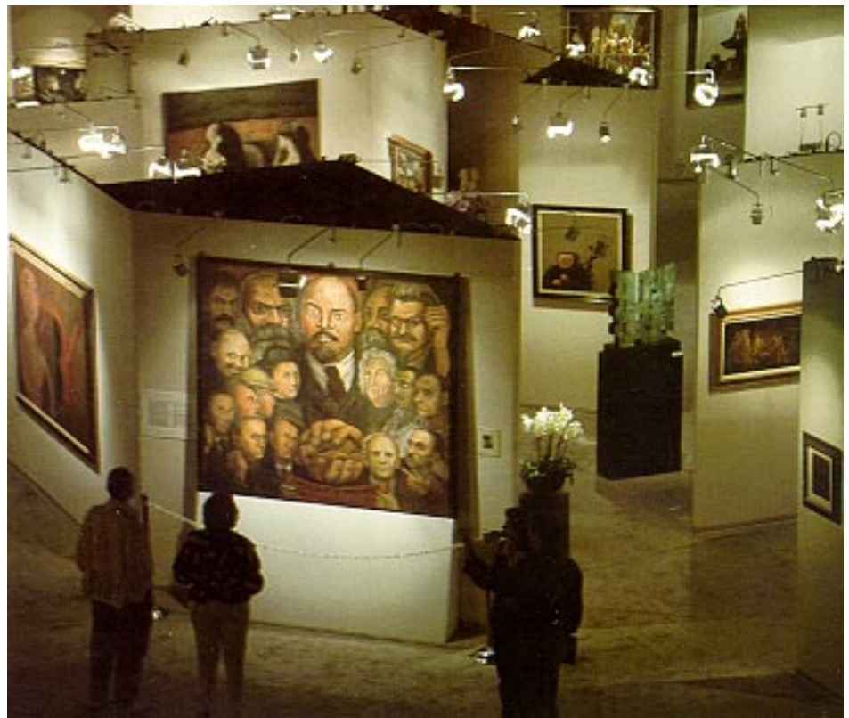
mam/fa stand at Art Miami '95

This column will deal with questions and concerns most frequently communicated to us by collectors and investors seeking our advice. The biggest issue at the moment is the crisis in Mexico and how that will affect the market for Mexican art. It is not possible to have all the answers, of course, but judging from the past twelve years it appears that the market has risen steadily and that prices will hold and rise in the long run. In the short term, some prices will probably drop, especially for artists whose market is unilaterally Mexican, e.g., Dr. Atl or Claussel. For artists with worldwide markets like Tamayo, Rivera and Kahlo, the situation is rosier. Still, Mexico provides the backbone for some of the highest prices achieved by these artists (consider the record prices for Mexican art set at auction in the last year) and bidding against foreign collectors will be doubly expensive for Mexican collectors in the next set of sales. Also, many Mexican collectors are considering selling artworks to raise cash for investment in the low stock market in Mexico right now, so increased supply may provide some bargains for alert collectors of Mexican art.