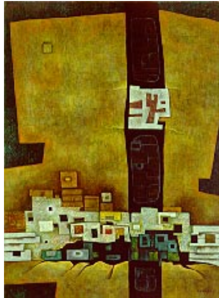
Gunther Gerzso, Presence of the Past , oil on masonite, 1953, 28¾ x 21¼ inches (73 x 54 cm)

mam/fa has had a long association with Gunther Gerzso, participating in book publishing projects, as well as collaborating on graphic and sculpture editions. This will be the third one-man show that mam/fa has held of Gerzso's work. The first was a retrospective held in 1982 at FIAC in Paris, in collaboration with Galería de Arte Mexicano. The second show at Mary-Anne Martin/Fine Art in 1984, was his first New York exhibition. This was held in