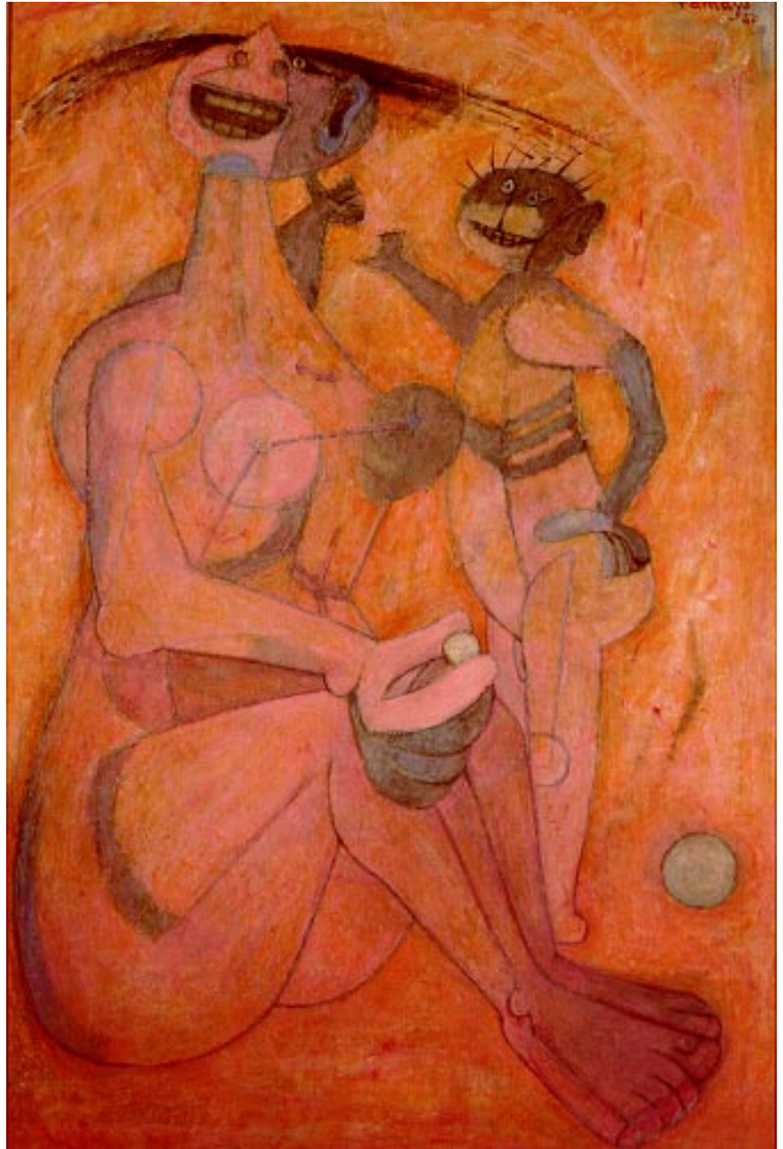
Rufino Tamayo, La Perla , 1950, oil on canvas, 76 3 / 8 x 50 3 / 8 inches ( 194 x 128 cm)

The painting has been in private hands for many years and has seldom been exhibited. It did travel to three cities in Japan in 1993-94, in an important retrospective Tamayo exhibition organized by The Nagoya City Art Museum. This was the last great exhibition mounted in Tamayo's honor that the late Olga Tamayo, his widow, was able to attend.