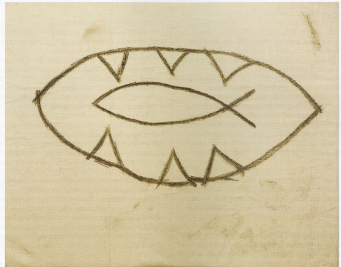
Joe Bradley. Abelmuth , 2008, grease pencil on canvas, 40 x 60 inches. Courtesy of CANADA, New York and Peres Projects, Los Angeles, Berlin.