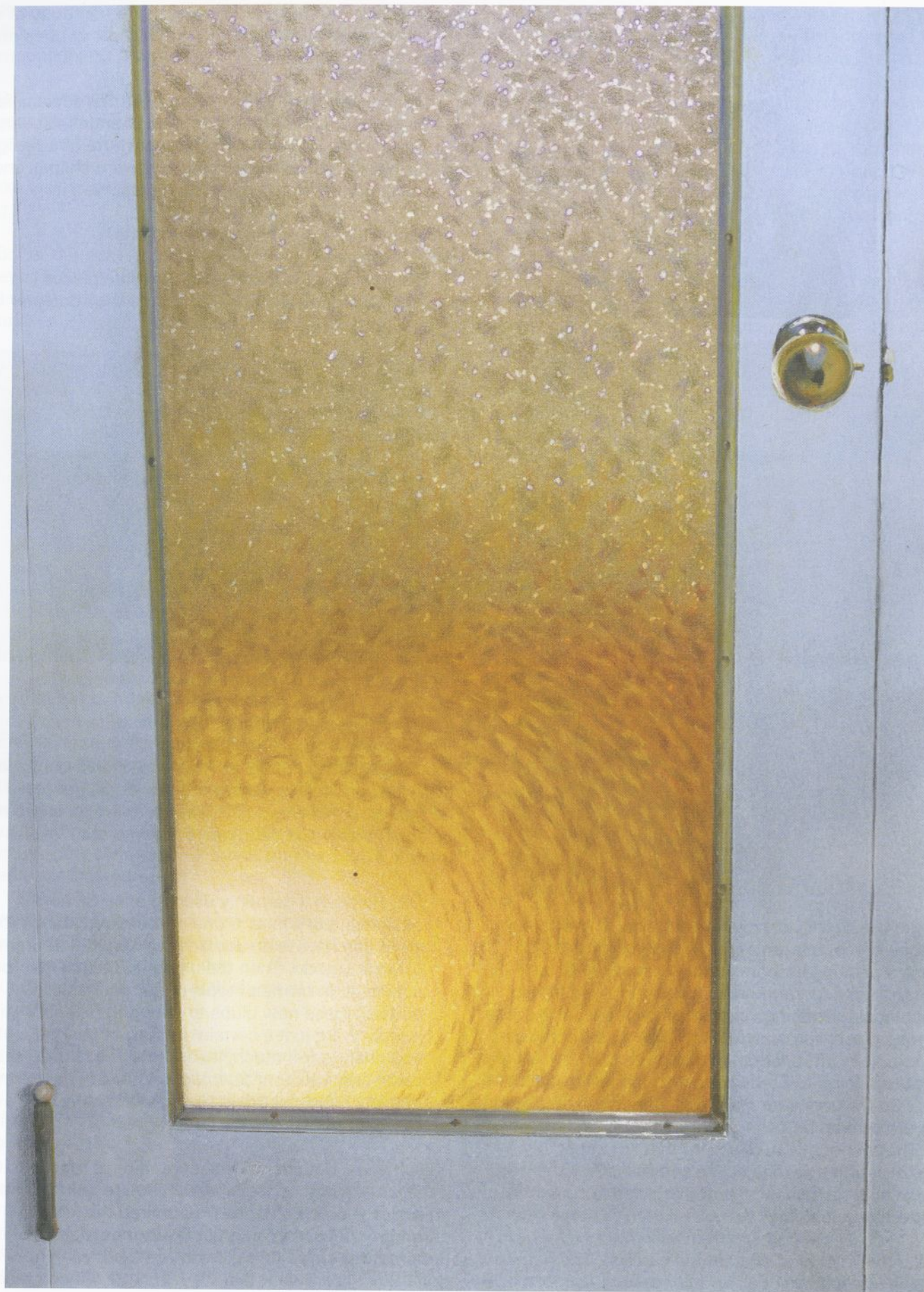
Dike Blair, Untitled , 2009, gouache and pencil on paper, 24 x 18 inches.

the point where I'm refining an idea, I tend to get bored. Maybe I'll just keep starting from scratch and hope it all makes sense somehow.